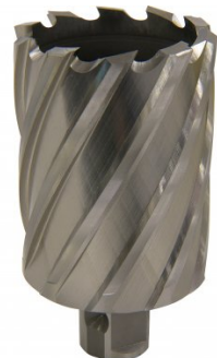
D9582 HSS Drill Broach Cutter