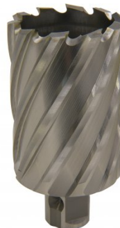
D9580 HSS Drill Broach Cutter