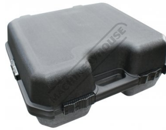
Durable Plastic Case