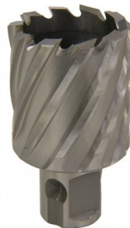
D9535 HSS Drill Broach Cutter