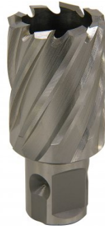
D9528 HSS Drill Broach Cutter