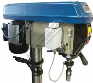
Shown Mounted to Drilling Machine