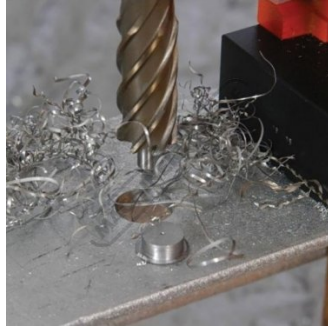
Shown in Action