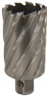
D9578 HSS Drill Broach Cutter