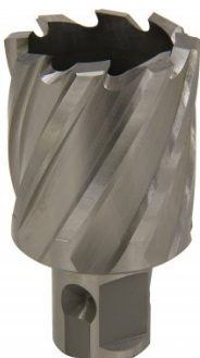
D9534 HSS Drill Broach Cutter