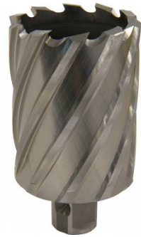
D9582 HSS Drill Broach Cutter