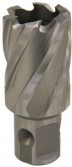
D9526 HSS Drill Broach Cutter