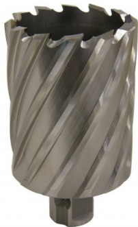
D9584 HSS Drill Broach Cutter