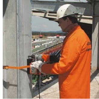
Shown in Action on Job Site