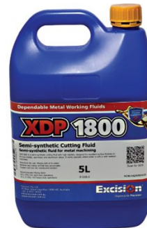
S090 Soluble Metal Cutting Fluid - 5 Litre