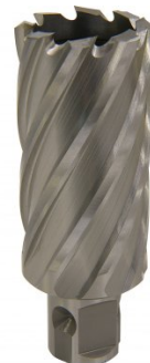
D9570 HSS Drill Broach Cutter