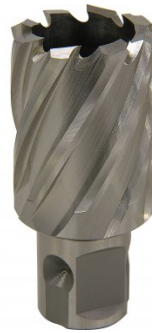
D9528 HSS Drill Broach Cutter