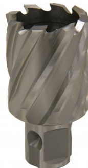
D9532 HSS Drill Broach Cutter