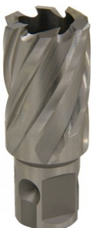
D9524 HSS Drill Broach Cutter