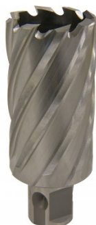
D9572 HSS Drill Broach Cutter