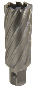
D9566 HSS Drill Broach Cutter