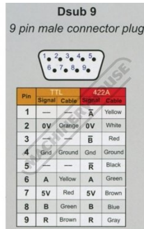
Dsub9 Wiring Diagram