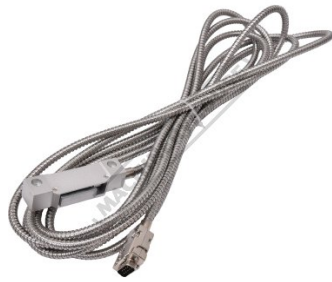
Dsub 9 and Reader Head Extension Cable