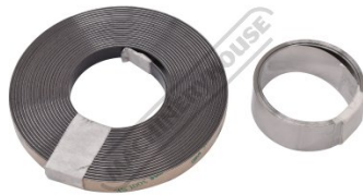
Magnetic Tape and Metal Protective Strip