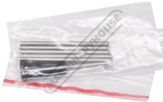
Aluminium Extrusion Joiner Pins