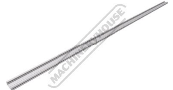
Aluminium Extrusion Length