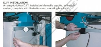
D.I.Y. INSTALLATION An easy-to-follow D.I.Y. Installation Manual is supplied with each system, complete with illustrations and mounting brackets.