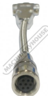
DIN7 Female Plug