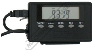
Digital Display Unit