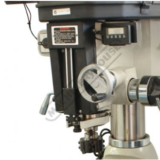
Z Axis Scale