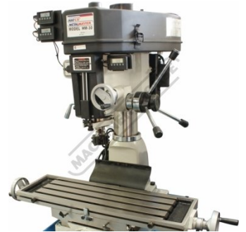
Multiple Axis shown Setup Up on Mill