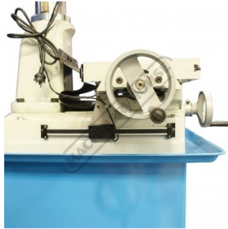
Y Axis Scale