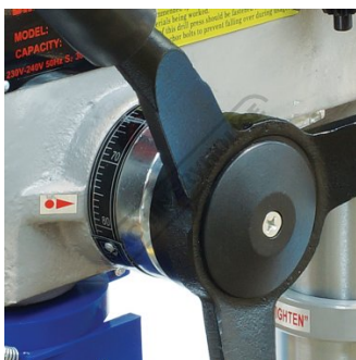
Drilling Depth Stop Setting With Scale