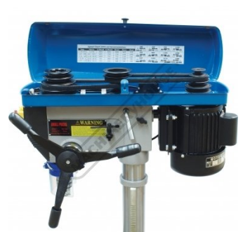
A Section Belt Drive System