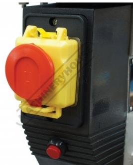
Emergency Stop Switch and Light Switch