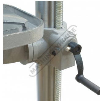
Table Height Adjustment Crank