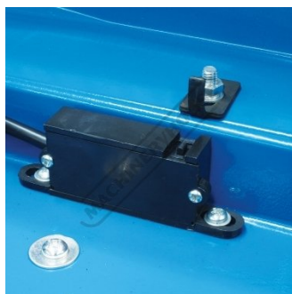
Safety Micro Switch on Pulley Guard