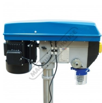
Head Side View