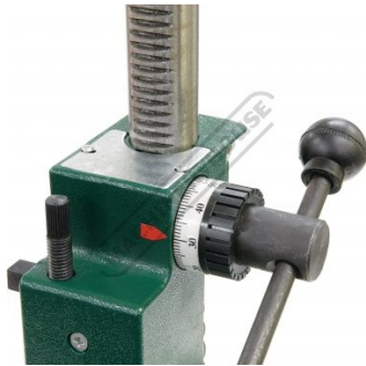
Rack and Pinion Quill Mechanism