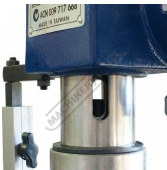
Drill Chuck Set Up For Removal