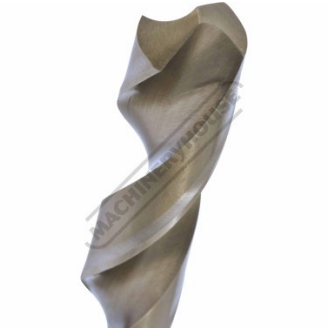
135 Degree Split Point M35 HSS 5% Cobalt