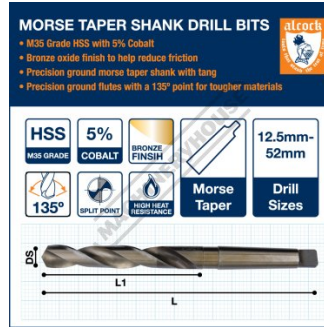
Morse Taper Shank Drill