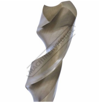
135 Degree Split Point M35 HSS 5% Cobalt