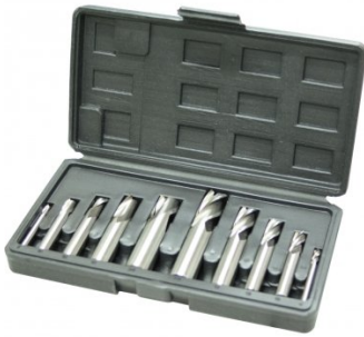
M3301 Metric HSS Slot Drill & End Mill Set - 10 Piece