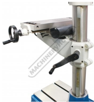
Rack and Pinion Wind Up Table