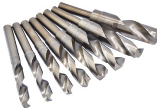
D1171 Metric Industrial HSS Reduced Shank Drill Set