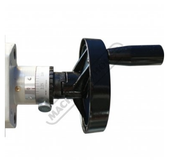
Table Longitudinal Travel Handle