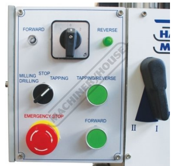
Emergency Stop Switch and Overload Protection and Tapping Function