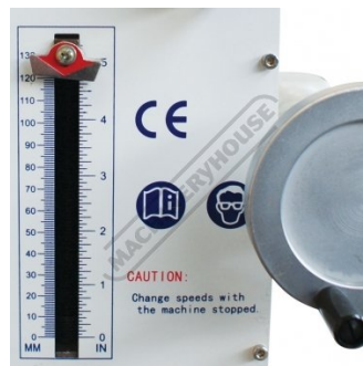
Adjustable Accurate Depth Setting For Increased Productivity