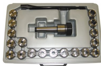
C922B Collet & Chuck Set - 8 Piece