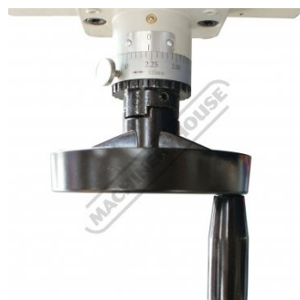
Table Cross Travel Handle