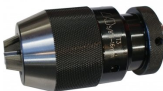
C294 Industrial Drill Chuck - Keyless Type