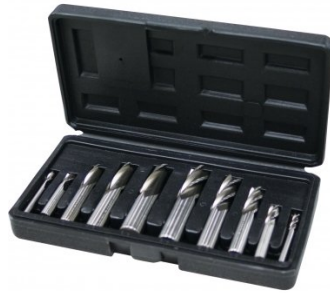
M3321 Imperial HSS Slot Drill & End Mill Set - 10 Piece