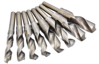
D1181 Imperial Industrial HSS Reduced Shank Drill Set