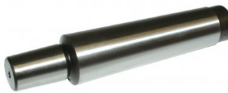
D4436 3MT x JT6 Drill Chuck Arbor - 1/2" BSW Threaded Shank