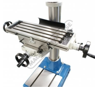
T Slotted Work Table