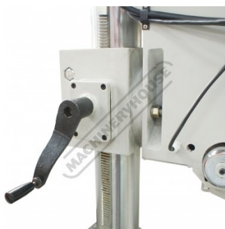
Rack and Pinion Wind Up Drill Head