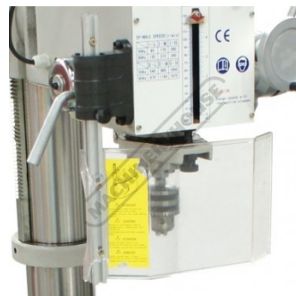
Swivel Safety Drilling Chuck Guard