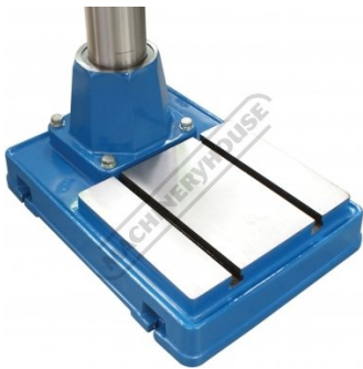
T Slotted Base