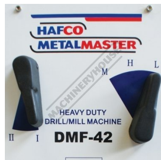
Gear Selection Levers