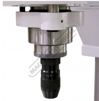
Drill Chuck And Arbor