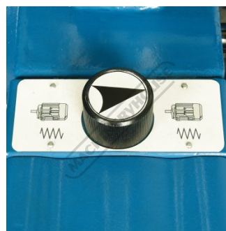
Manual Drive Or Motor Gear Drive Dial