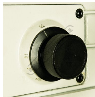
Automatic Feed Selection Dial