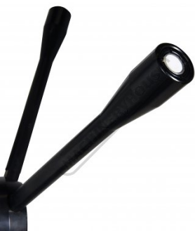
Electronic Feed Engagement