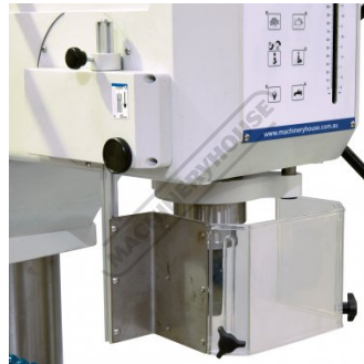
Interlocked Spindle Safety Guard