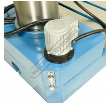
Coolant Pump System