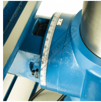
Table Tilt Adjustment Graduations