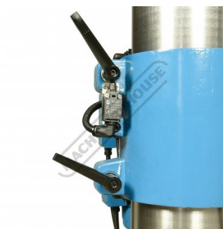
Table Clamps with Safety Micro