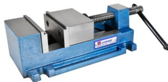
V141 Safeway Precision Drill Press Vice