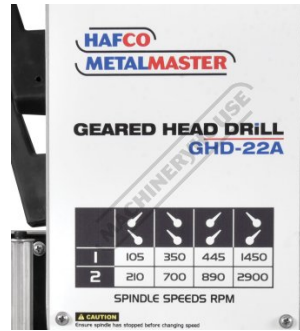
High/Low With Forward & Reverse & Spindle Speeds