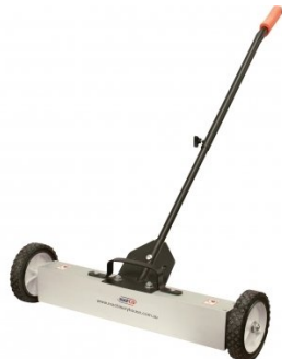
M9991 Magnetic Floor Sweeper