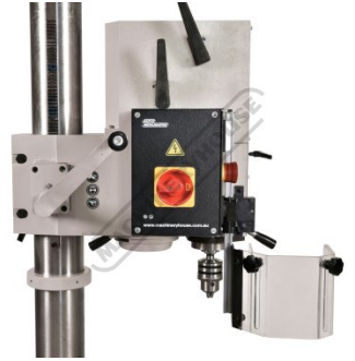
Rack & Pinion Wind Up Drill Head