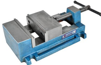
V142 Safeway Precision Drill Press Vice