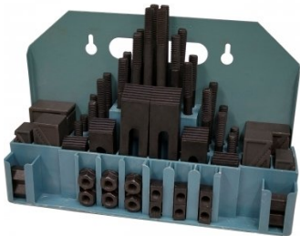
C0965 Clamp Kit 58 piece - Workshop Series