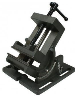
V114 Tilting Drill Press Vice