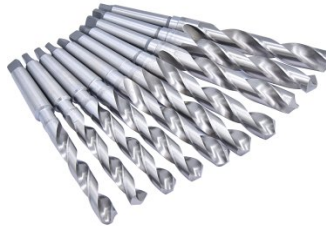
D119 Metric 2MT HSS Drill Set