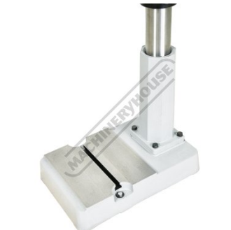
T Slot Base