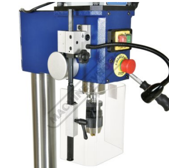
Drill Chuck Safety Guard with Micro Switch