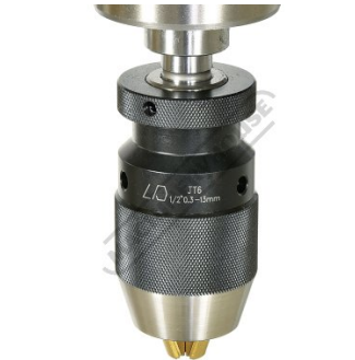
13mm Keyless Drill Chuck