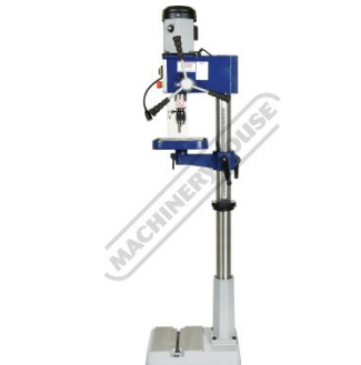
Rack and Pinion Fully Up