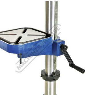
Table with Rack and Pinion Wind Up