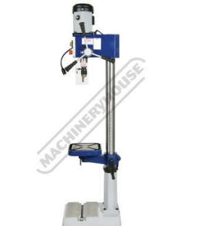
Rack and Pinion Fully Down