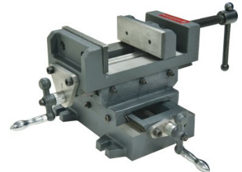
V1205 Compound Drill Vice