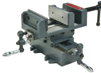
V1204 Compound Drill Vice