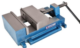
V143 Safeway Precision Drill Press Vice