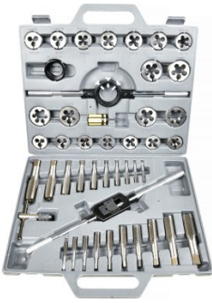
T015 Imperial Alloy Steel Tap & Die Set - 45 Piece