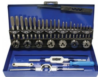
T012 Metric Alloy Steel Tap & Die Set - 32 Piece