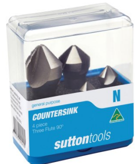
D106 Countersink Sets – 90° Three Flute