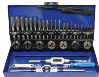
T012 Metric Alloy Steel Tap & Die Set - 32 Piece