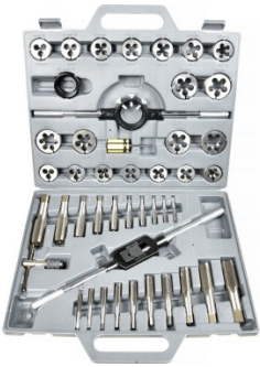
T015 Imperial Alloy Steel Tap & Die Set - 45 Piece