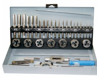
T013 Metric HSS Tap & Die Set - 32 Piece