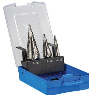
D107 HSS Step Drill Sets