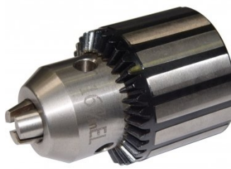
C290 Heavy Duty Drill Chuck - Keyed Type