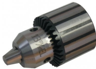
C289 Heavy Duty Drill Chuck - Keyed Type