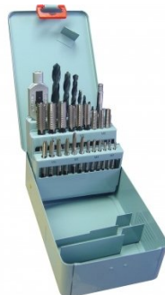
T019 Metric HSS Hand Tap & Drill Set - 29 Piece