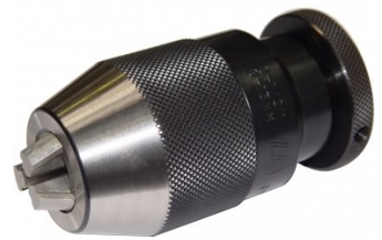
C292 Industrial Drill Chuck - Keyless Type