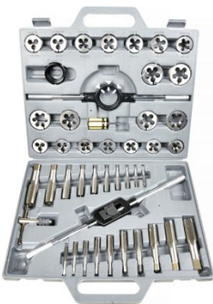
T015 Imperial Alloy Steel Tap & Die Set - 45 Piece