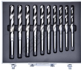
Case Top View