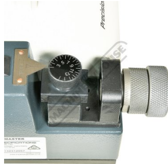
Drill Setting Gauge