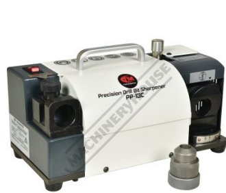
Shown with Drill Chuck