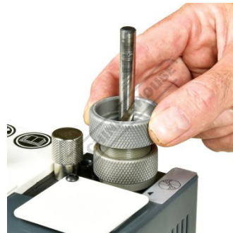
Grinding Split Point Station