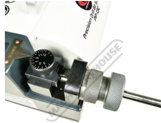
Drill Setting Gauge with 9mm Drill Bit