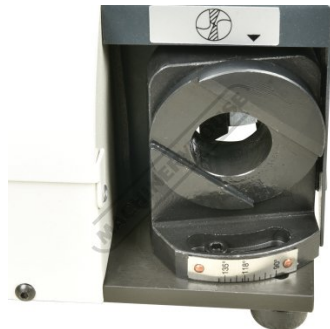
Drill Angle Setting at 90 Degrees