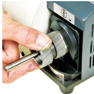
Sharpening Drill Bit Station 1