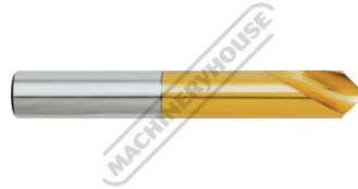
Spotting drill 90