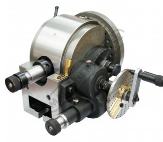
Rear View 2