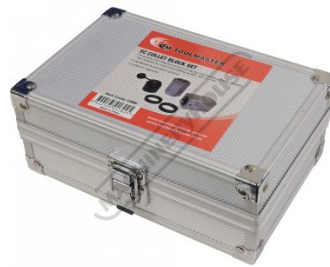
Aluminium Storage Case Closed