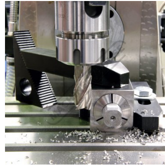
Shown Used with Square Holder