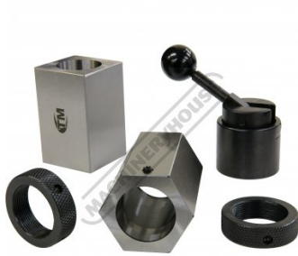
Square, Hexagonal Holders & Collet Clamp