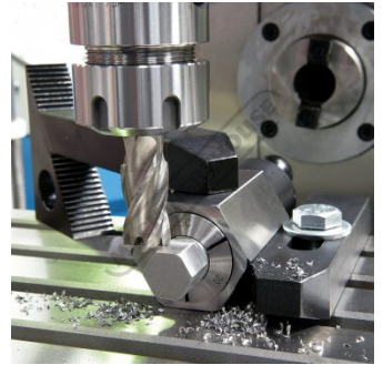
Shown Used with Hexagonal Holder