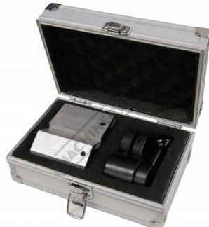
Aluminium Storage Case