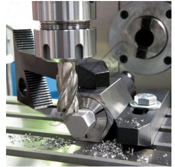
Shown Used with Hexagonal Holder