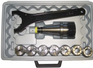
C962 Collet & Chuck Set - 9 Piece