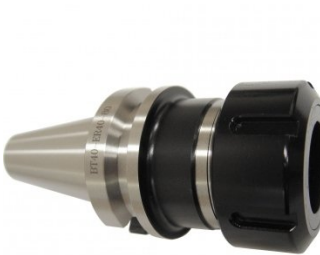
T226 BT40 x ER40-80 Collet Chuck