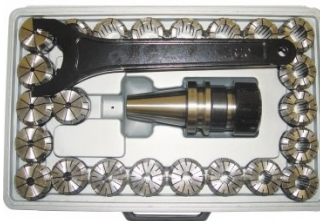
C967 Collet & Chuck Set - 25 Piece