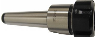
C106 Collet Chuck - R8 x ER32