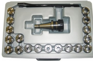
C929 Collet & Chuck Set - 20 Piece