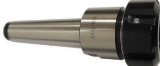
C106 Collet Chuck - R8 x ER32