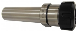
C931 32 x 100 x ER32 Collet Chuck - Straight