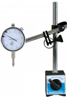
M055 Magnetic Base and Dial Indicator