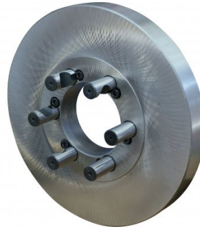
L289 D1-6 Camlock Back Plate