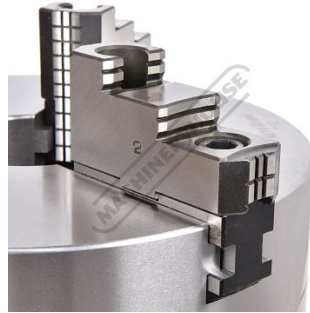
Jaw Rear View