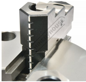
Jaw Front Profile