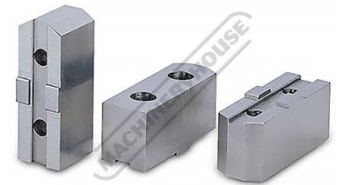
Optional Soft Jaws