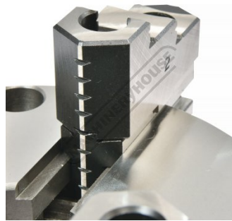
Jaw Front Profile