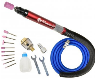
A043 Air Micro Die Grinder Kit