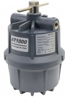
C492 Plasma Sub-Micronic Air Filter Canister