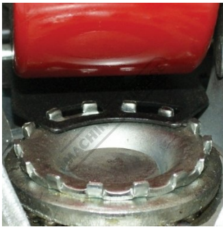
Foot Brake With Swivel Base Lock