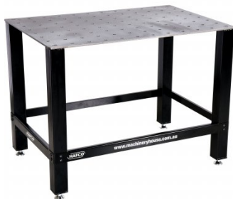
W08455 Welding Table