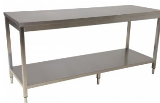
F280 Stainless Steel Island Work Bench