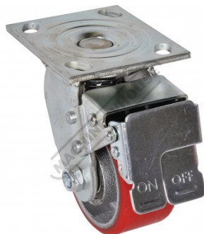
Swivel Wheel With Brake