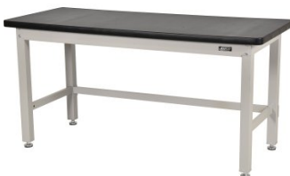
A420 Industrial Work Bench