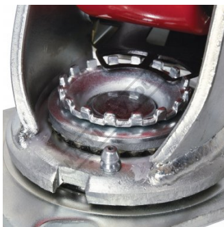
Ball Bearing Base With Greasing Nipple