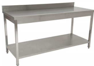
F298 Stainless Steel Bench with Splashback