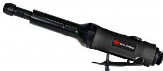
A041 Air Die Grinder - Extended Shaft 5" (127mm)