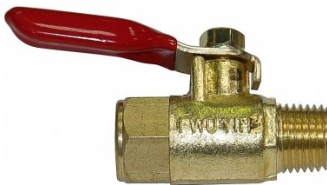
F930 Air Fittings