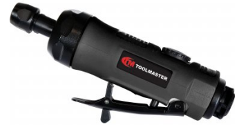
A040 Air Die Grinder