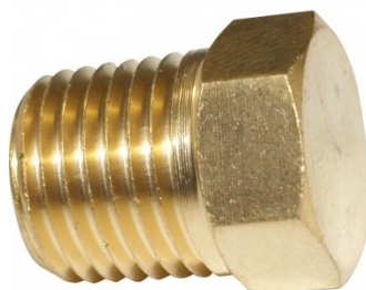
F870 Air Fittings