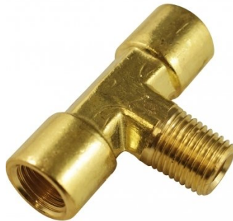
F880 Air Fittings