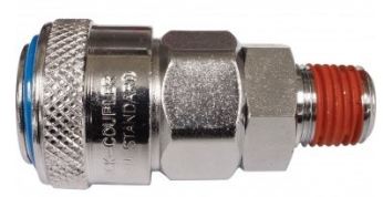
F941 High-Flow One Touch System Air Fittings