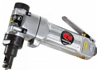
A082 Air Nibbler