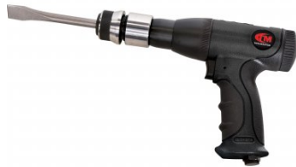
A039 Air Hammer Chisel - Vibration Damped