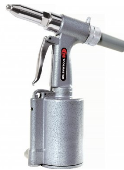
A046 Air Pop Rivet Kit