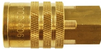
F900 Air Fittings