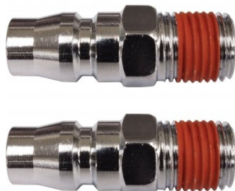
F951 High-Flow Air Fittings