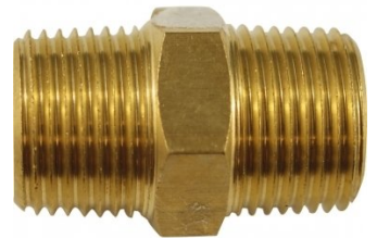
F864 Air Fittings