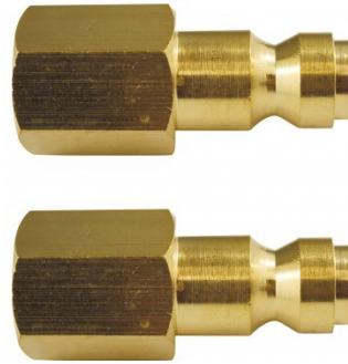
F903B Air Fittings