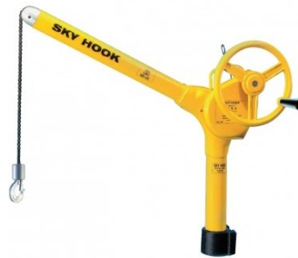
A358 Sky Hook Lifting Device