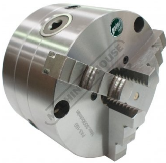
Chuck with Mounting Plate