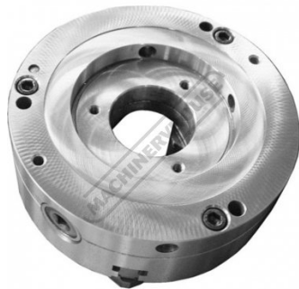
Back of Chuck