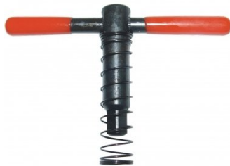
A358 Sky Hook Lifting Device