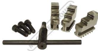
2 Included Accessories