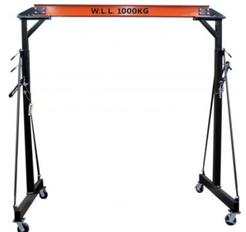
C188 Mobile Girder Rail Gantry