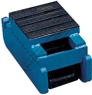
Shown With Optional Skate