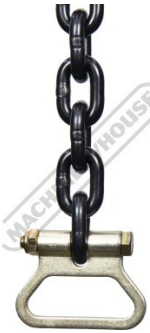
Length Chain End