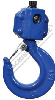
Bottom Hook Assembly