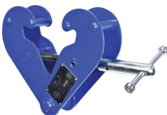
C146 Girder Clamp