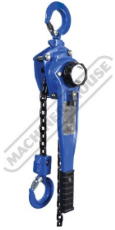
Main View Handle Down