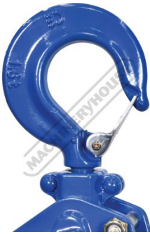
Top Hook Assembly