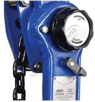
Lever Handle Mechanism